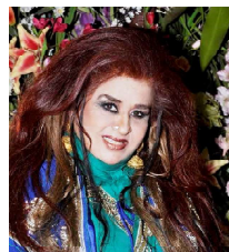
By: Shahnaz Husain

Hyperpigmentation may seem like a summer thing and a nonissue during the winter months, but this isn't the case