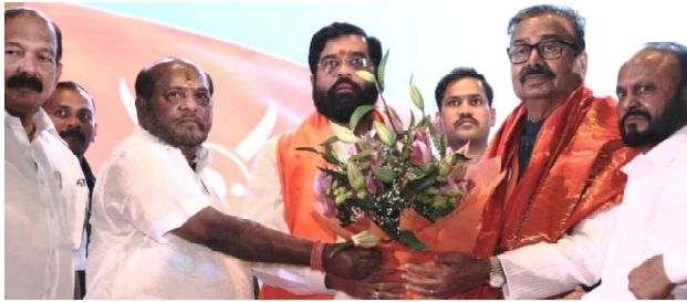
Maharashtra Chief Minister Eknath Shinde welcoming MP Gajanan Kirtikar (third from right) in his party.